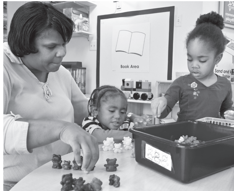
Children engage with the KDIs — the building blocks of thinking and reasoning at each stage of development — as they interact with people, materials, events, and ideas.

The HighScope KDIs are based on current child development research and decades of classroom practice. The KDIs are also written to be universal. Teachers and caregivers from different cultures in the United States and countries all over the world report that they see children engaging in these developmentally important experiences. Research confirms these commonalities among children of all backgrounds. For example, children