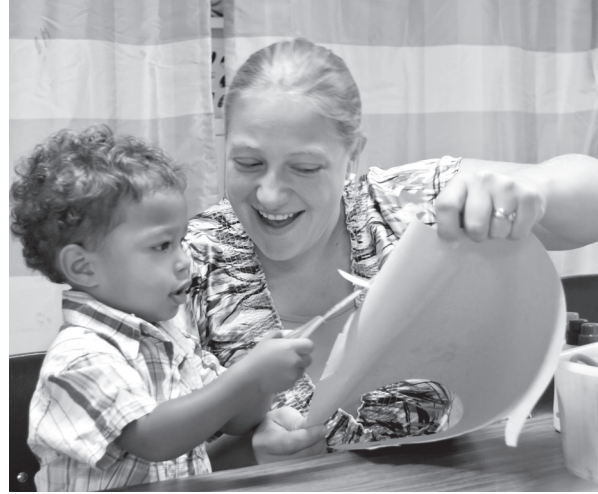
The HighScope approach emphasizes active participatory learning, where teachers and students are partners in shaping the learning experience.

HighScope teachers are as active and involved as the children. They thoughtfully provide materials, plan activities, and talk with (not at) children in ways that both support and challenge what children are observing and thinking. Activities are