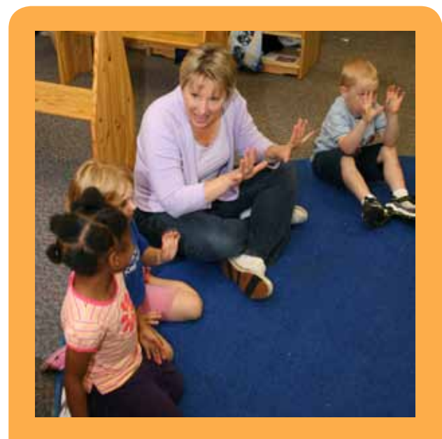
KDIs help teachers plan for the segments of the daily routine. This large-group movement and music activity is planned around KDIs in Creative Arts and Physical Development and Health.

The KDIs also provide a window on the daily routine, that is, some indicators may tend to occur more often or more readily at certain times of the day. For example, in a well-organized setting, there are days when cleanup time is characterized by concentrated classifying (KDI 46) as children sort and match toys before putting them away. After children decipher a message board announcement about a new material in the classroom, they