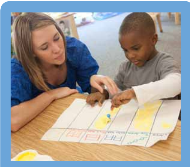
By using a planning chart, this child thinks intentionally about what he will do at work time.

The eight content areas and 58 KDIs within them are significant for adults using the HighScope Preschool Curriculum because they provide a framework for supporting children's real activities. When children are actively engaged with people and materi-