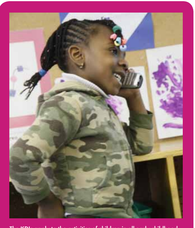
The KDIs apply to the activities of children in all early childhood settings. In every country and culture, for example, children enjoy imitating, pretending, and using items they see adults using.

The term key developmental indicators encapsulates HighScope's approach to early education. The word key refers to the fact that these are the meaningful ideas children should learn and experience. HighScope acknowledges that young children need to master a wide range of specific knowledge and thinking skills — the list could be almost endless in scope and detail. To avoid losing sight